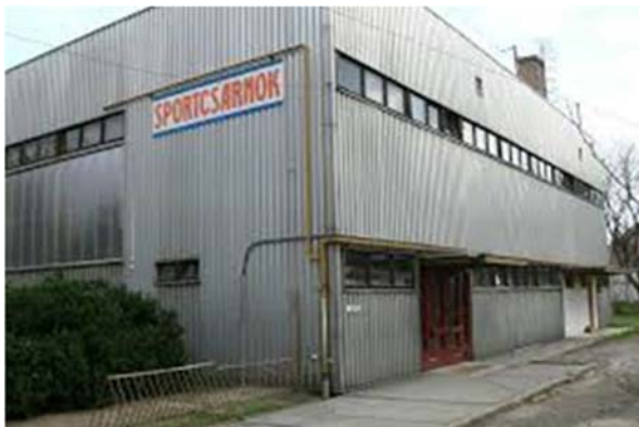
Városi sportcsarnok (old hall) Ipolypart street 5.