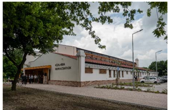
Kézilabda Munkacsarnok (new hall) Nádor street 28.